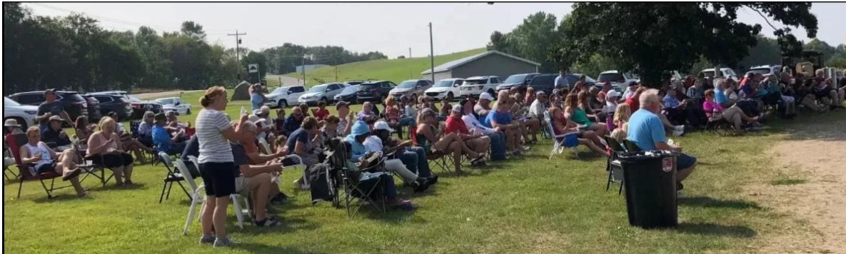
Lizzie Lake Association Annual Meeting