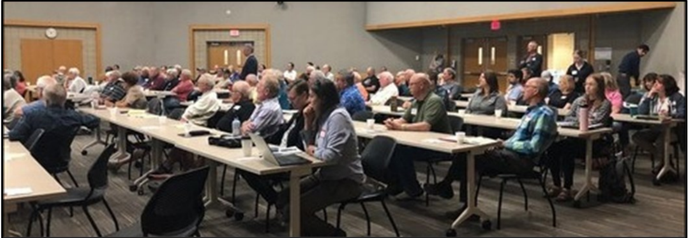
MAISRC Research Update June 9