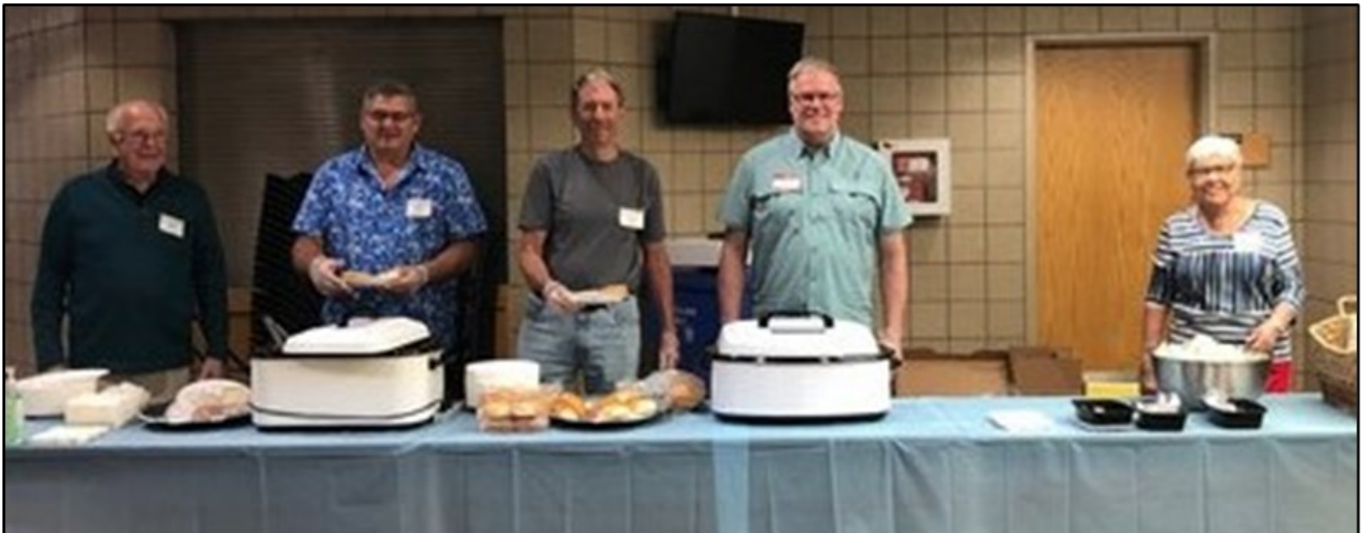
The mid-day meal was served by OTC COLA and OTC Task Force Directors

The University of Minnesota Aquatic Invasive Center (MAISRC) event occurred on June 9, 2022 in Detroit Lakes, MN. The event was sponsored by Hubbard County COLA, Becker County COLA, Pelican River Watershed District, Becker Soil & Water Conservation District, Otter Tail County AIS Task Force and Otter Tail County COLA. Newsletter articles and flyers were provided by OTC COLA. Automated registrations and event administration were accomplished with the Lake Property Owner Event Administration system.