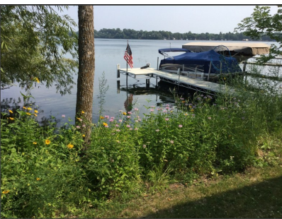
EOT SWCD- Shoreline Program pdf