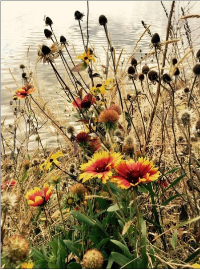
EOT SWCD- Shoreline Restoration Flyer