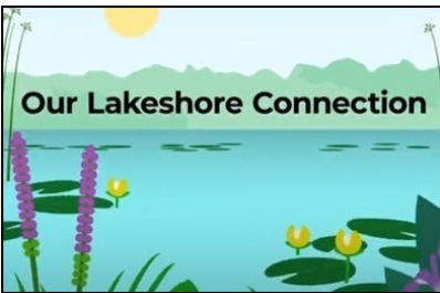
Our Lakeshore Connection Video