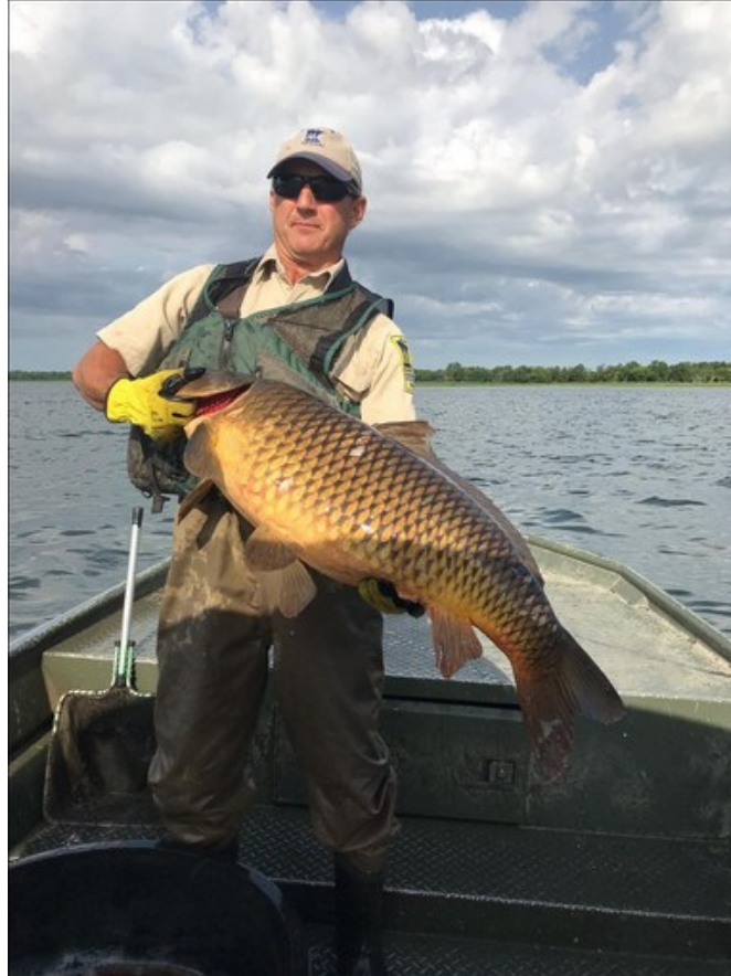
Star Lake 2018 Summer Survey