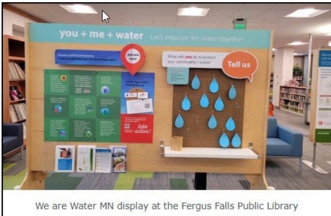
We are Water MN display at the Fergus Falls Public Library