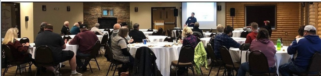
Lake Service Provider Appreciation Event