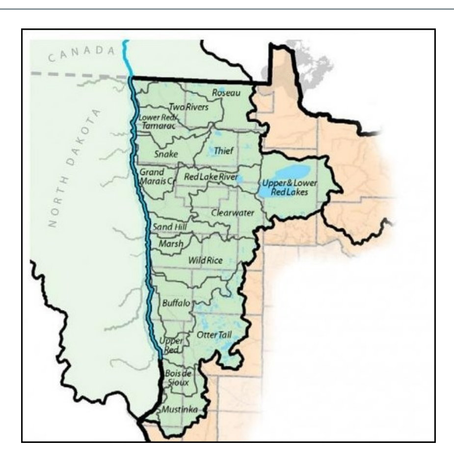
Red River Basin Partnerships Deliver Solutions

Green up your holiday shopping by giving reusable and refillable gifts! Check out great gift ideas that help the planet in the Green Gift Guide: