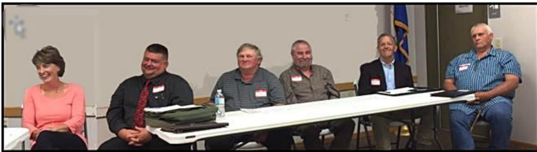
OTC Commissioner Candidates