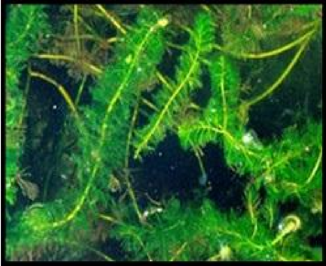
Eurasian Water Milfoil