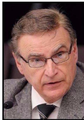
Rep. Bud Nornes